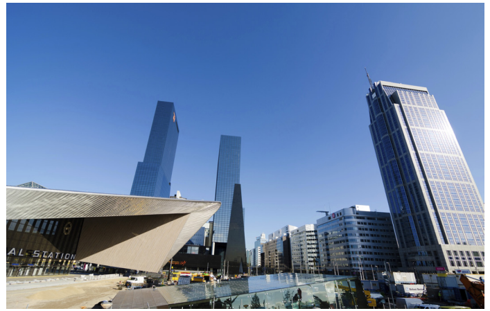
The new Central Station, opening in March 2014, matches the architecture of the surrounding buildings in downtown Rotterdam.

"We based the details from the very beginning on AutoTURN," said Edelenbosch. "During the process, we changed the platform design and we checked with AutoTURN all the time to see if the changes were possible."